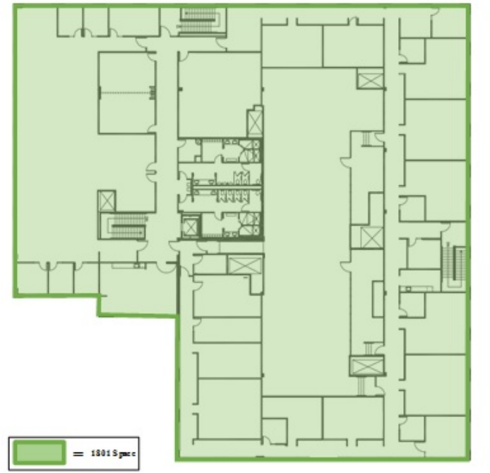
1801 SECOND FLOOR HARBOR BAY PARKWAY THE WATERFRONT ALAMEDA, CA