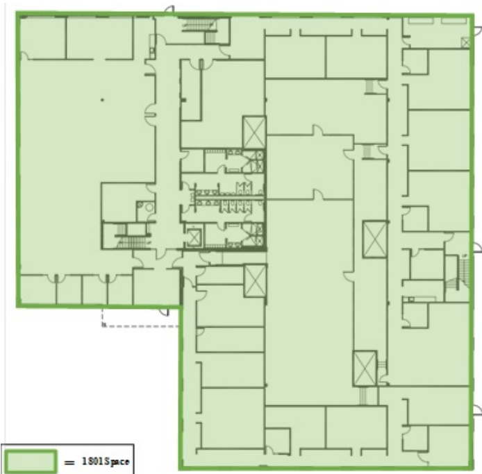
1801 FIRST FLOOR HARBOR BAY PARKWAY THE WATERFRONT ALAMEDA, CA